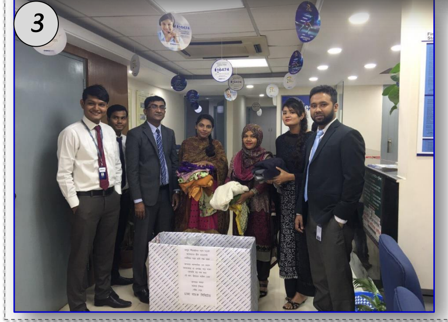
Photo Srl # 1 & 2, two valued Customers of Kamarpara Branch are donating clothes while Srl # 3, three female Colleagues of that Branch are participating with some clothes.